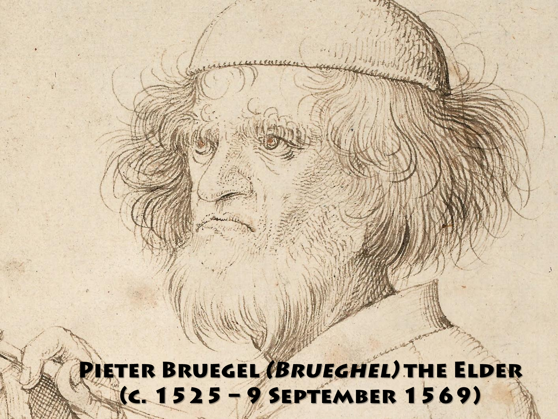
PIETER BRUEGEL (BRUEGHEL) THE ELDER (c. 1525 - 9 SEPTEMBER 1569)