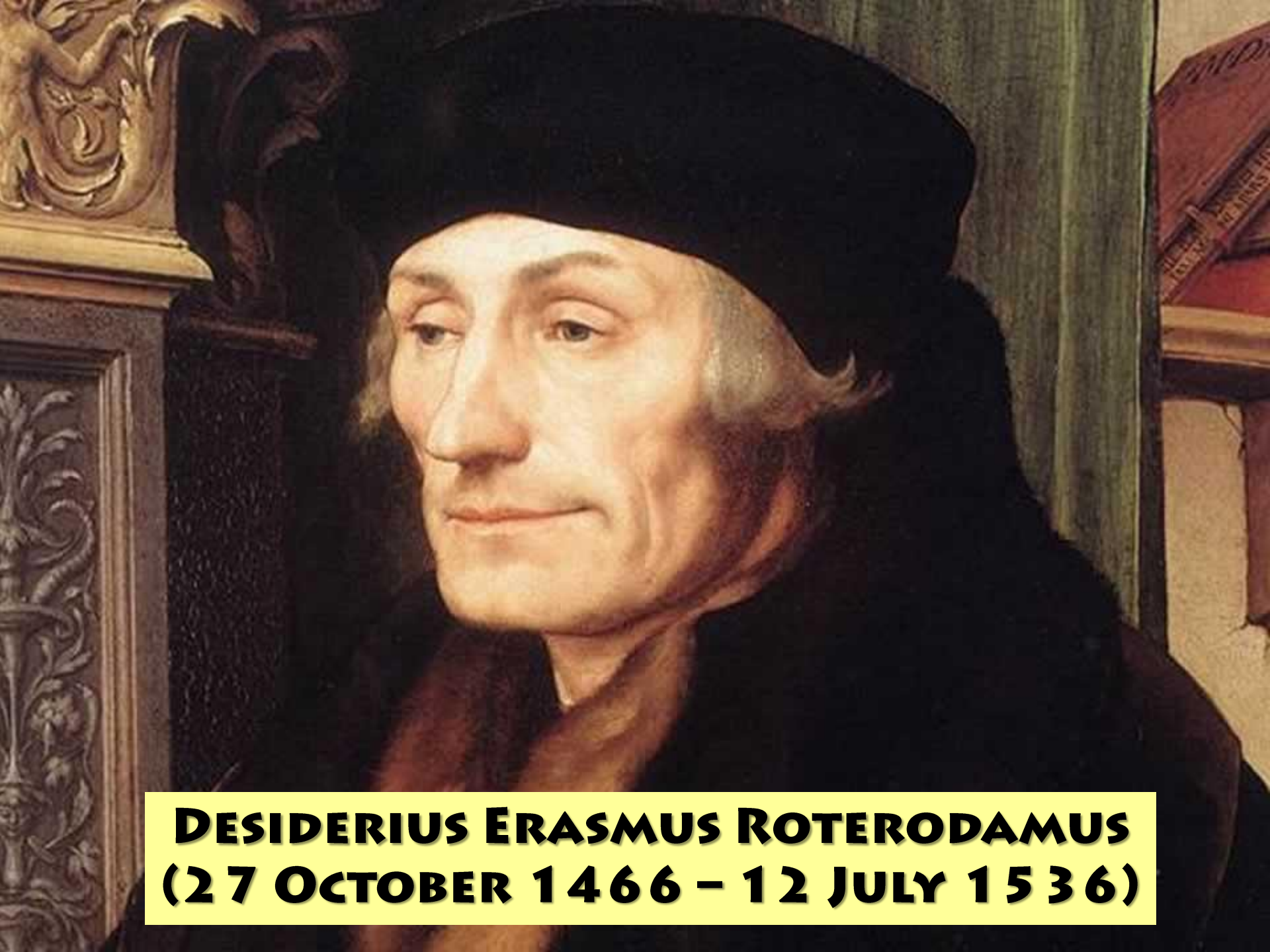
DESIDERIUS ERASMUS ROTERODAMUS (27 OCTOBER 1466 – 12 JULY 1536)